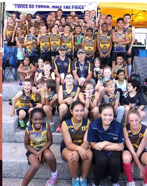
Whittlesea City Region Team 2016

Congratulations to the 62 athletes that qualified to compete at State on the 19 th & 20 th of March!